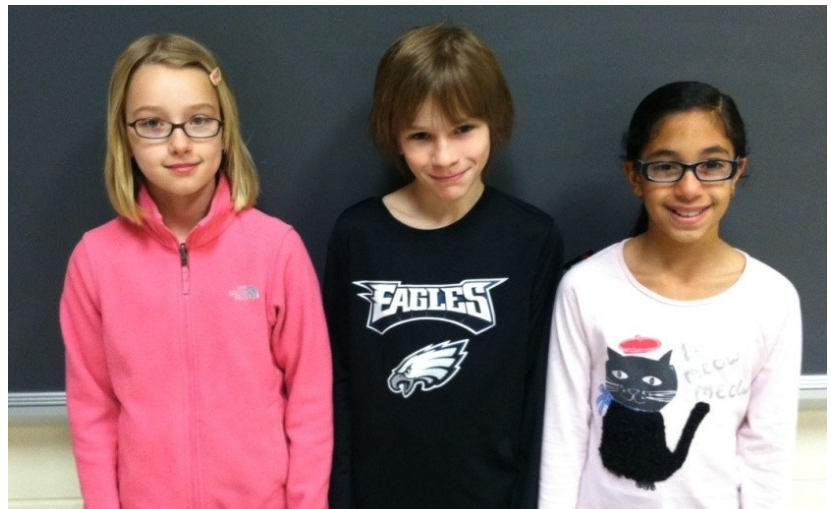
2014 Americanism Essay Winners. Congratulations!

The winners of the American Legion Post 116 Americanism Essay contest will be honored at a luncheon on Tuesday, April 15 th at 12:30. Winners will also receive a cash prize, a medal, and a certificate at the luncheon. We are very proud of these students and wish them the best of luck as they enter the national competition.