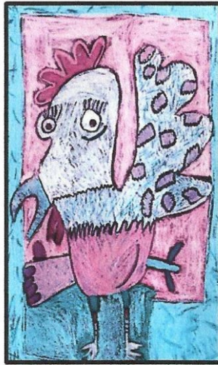
Artwork by Kaliyah Corbin, Gr. 3, PES

OCES Yearbooks are on sale now until April 8th for $25.00 . After April 8th, the price will increase to $35.00. Be sure to fill out the order form that has been sent home and get that order in before the price goes up!!